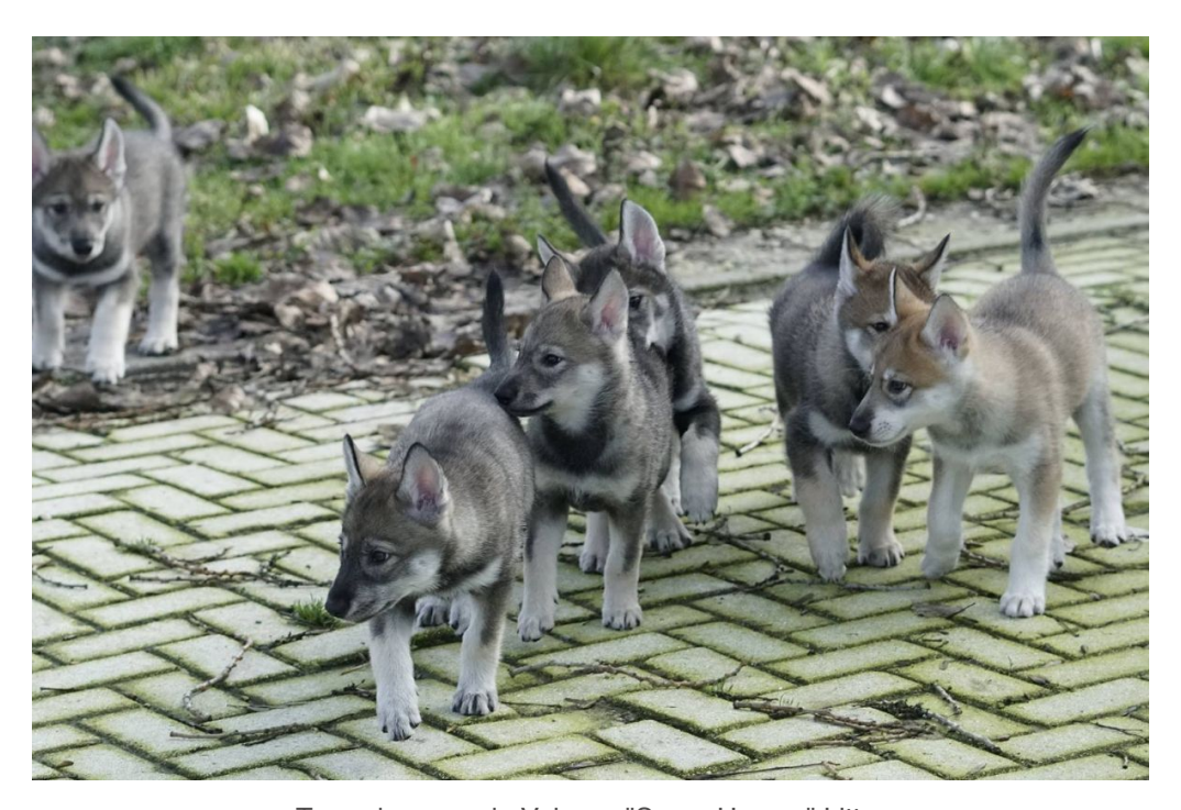
Tamaskan van de Veluwe, "Super Heroes" Litter