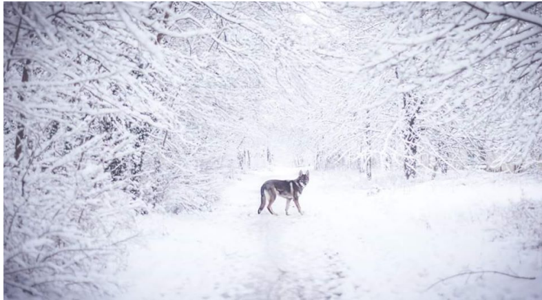
of the beautiful Fin Raziel du Lignage, call name "Nox," located in France.

Greetings from the Tamaskan Dog Register! Winter solstice is fast approaching for those of us on the Northern Hemisphere, and with that should bring cold weather and snow, which also means many happy Tamaskan dogs!