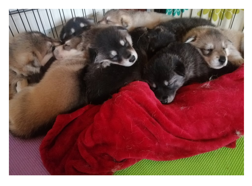
Mitologia Asturiana (Astur Mythology) Litter, photo courtesy of Del Bardial

Congratulations and a big welcome to the beautiful Mitología Asturiana litter of 3 females and 7 males at <u>Del Bardial</u>, born February 1, 2020 out of Sylvaen Targaryen x Sylvaen Lord Nagafen. Ylenia is still looking for placement for one male puppy -- please contact the kennel if interested.