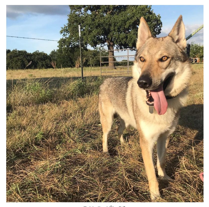
Zajda II od Úhoště "Alamo" Czechoslovakian Vlcak Residing at <u>South Paw Kennel</u>, Texas, USA

Alamo was sired by a champion of various working dog competitions, but his greatest personal goal is figuring out how to convince his owners to allow him to sleep on the couch. As a Czechoslovakian vlcak, he's a blend of both Slovak and Czech lines from parents who were both bonitated.